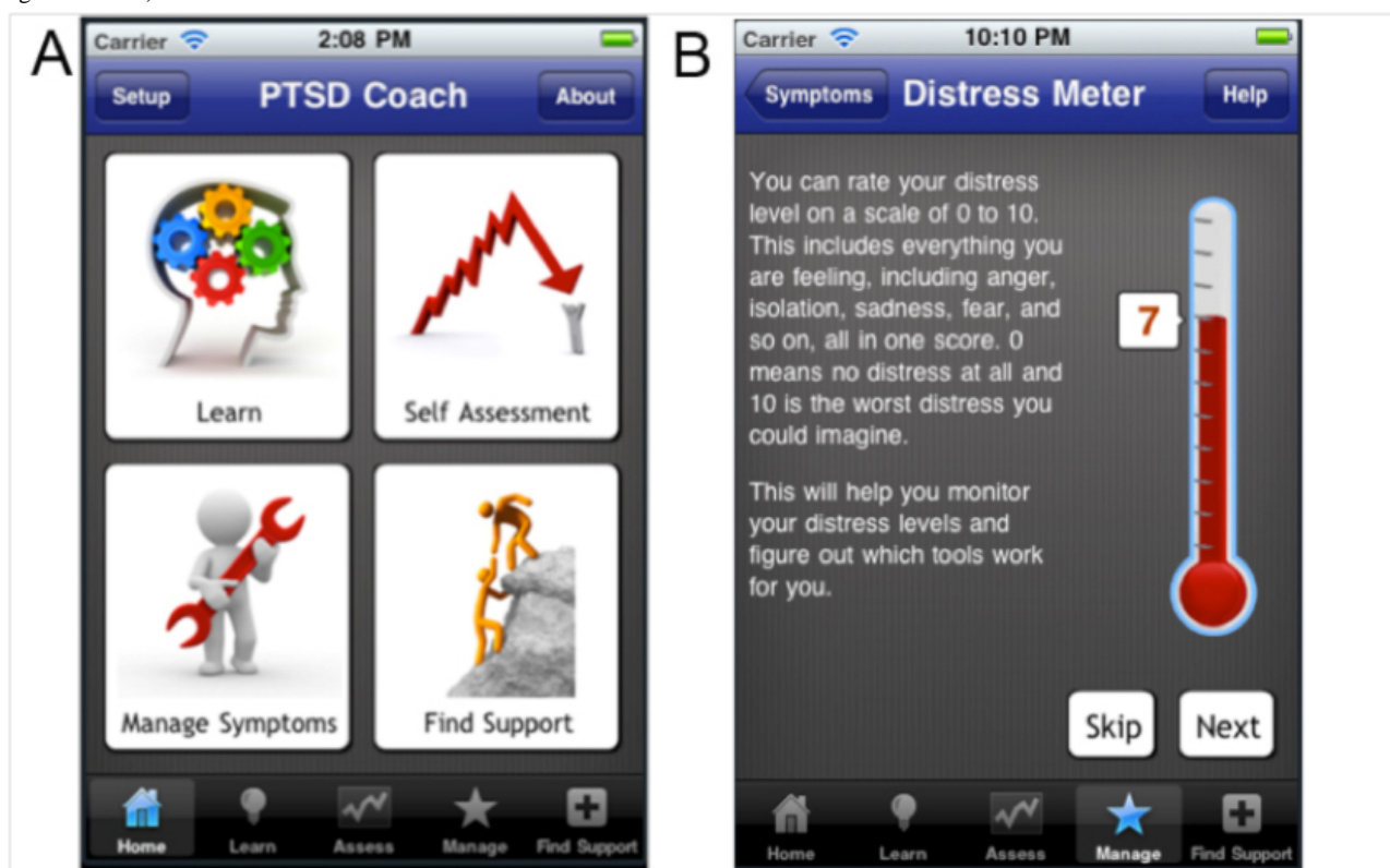
Figure 1. Screenshot of the PTSD Coach mobile phone application: (A) home screen and primary content areas: Education (Learn), Self-Assessment, Manage Symptoms (Tools), and Support; (B) Distress Thermometer (ie, subjective units of distress, measured before and after use of a symptom management tools).