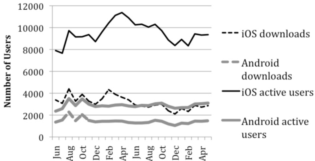
Figure 2. Downloads and active users of PTSD Coach between June 2012 and May 2014.

PTSD Coach also captured self-reported PTSD symptoms (using the PCL) for 10.3% of first-time users’ sessions and 20.9% of returning users’ sessions. Mean PCL scores, in first-time sessions was 57.2 (SD 15.7) and in return sessions was 55.1 (SD 16.6), which were well-above the National Center for PTSD’s recommended probable PTSD diagnosis cut point for use in VA or civilian specialty mental health clinics [21].